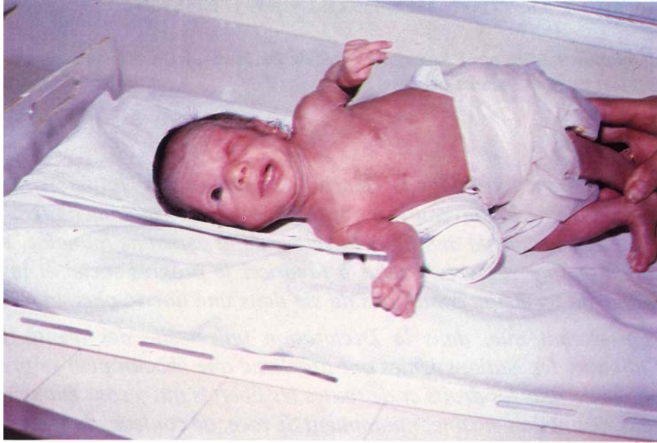
* FONTE PURULENTE GONOCOCCIQUE DE L'OEIL GAUCHE EN PERIODE NEONATALE